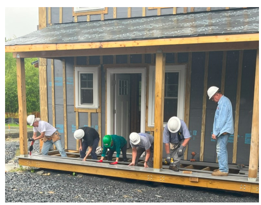
Part of the 2023 Missions Team working on one of the married couple housing duplexes.

Our July 2023 mission trip was focused on continued construction of the married student housing duplexes started in 2021. To date, 1 of the 9 duplexes has been completed, 5 more have been weathered in, and the last 3 are still to be started. We are looking forward to another productive year in 2024 with anticipated work in framing, roofing, siding, drywall and painting. In addition to the construction work, a team went to the college administrative buildings to help with office paperwork and library