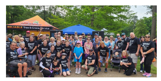
Bethel's Walk 4 Life Team