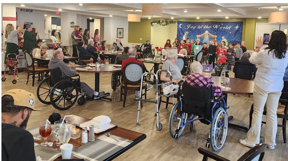
Bethel Baptist Christian School has also shown support and encouragement through our partnership with Harmony on the Peninsula. Their 1st & 2nd graders came out to share some Christmas joy and the love of Jesus with residents.

During Nurses Appreciation Week, Bethel gave gift bags to the nursing staff in appreciation for their work at Harmony on the Peninsula.