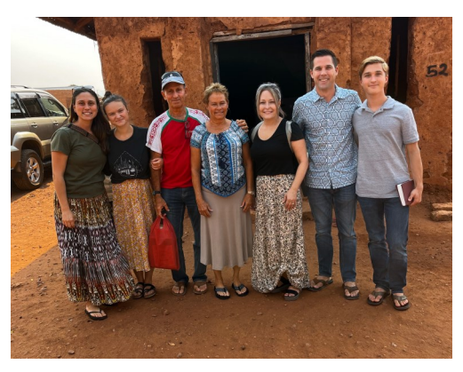
Bethel Tanzania Missions Team with local missionary

BBC Yorktown is partnering with the IMB in Tanzania by sending mission teams to Kigoma, Tanzania. Our mission teams support and encourage full time IMB missionaries engaged in evangelism and discipleship to local churches, home groups, and pastors.